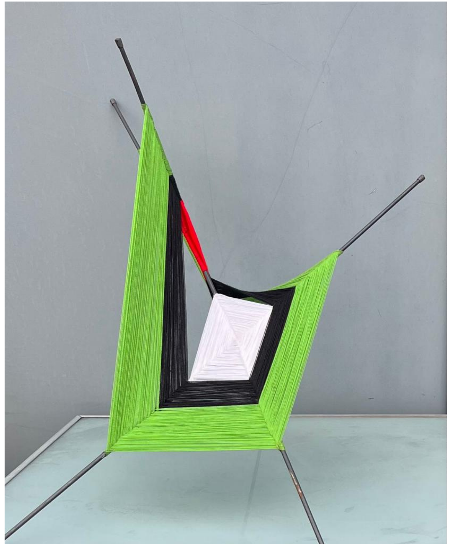
Threads of Resurrection (Green) , 2018 Metal & Ecuadorian Indigenous Threads 90 x 70 cm £3,000