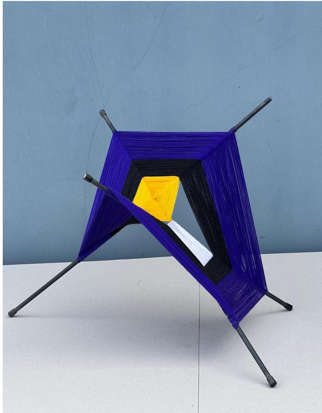
Threads of Resurrection (Purple) , 2018 Metal & Ecuadorean Indigenous Threads 40 x 60 cm £2,000